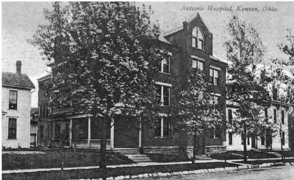
San Antonio Hospital in Kenton, as it appeared about 1910