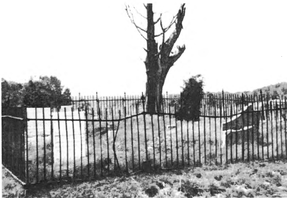
Cemetery on the Knoll