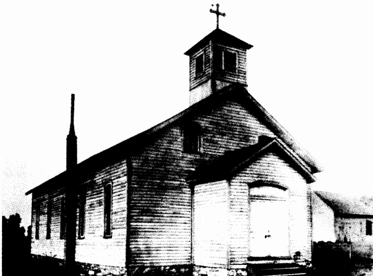
The first St. Cecilia Church, Galloway